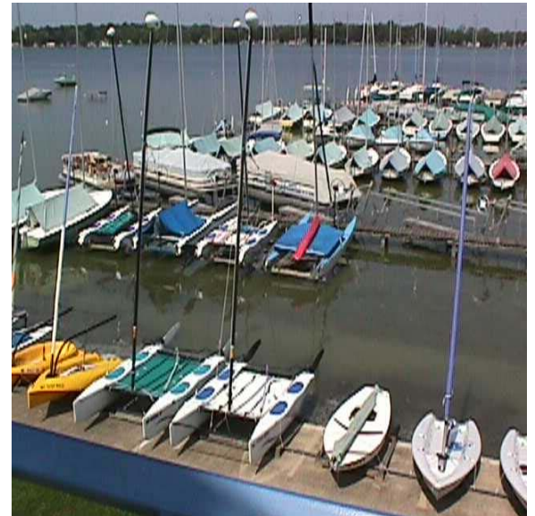
Portage Yacht Club Marina

Important notice: There is a minimum $40 fee for cancellation with less than 24 hours notice prior to a scheduled lesson or no show.