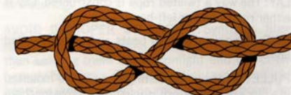
FIGURE 8 KNOT

To tie... Form a small loop in the rope. Run the end up through the loop, behind the standing part, then back down through the loop. Pull tight.